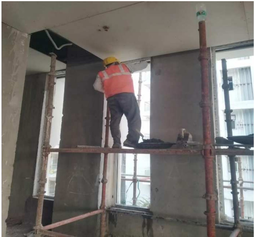
Any Other Work