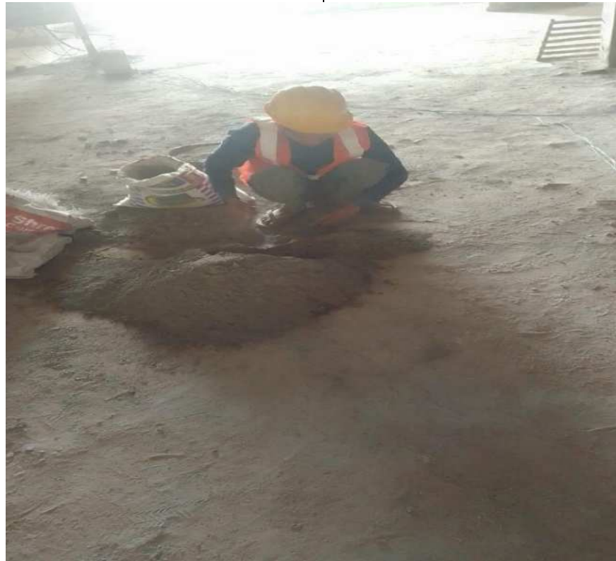
Any Other Work